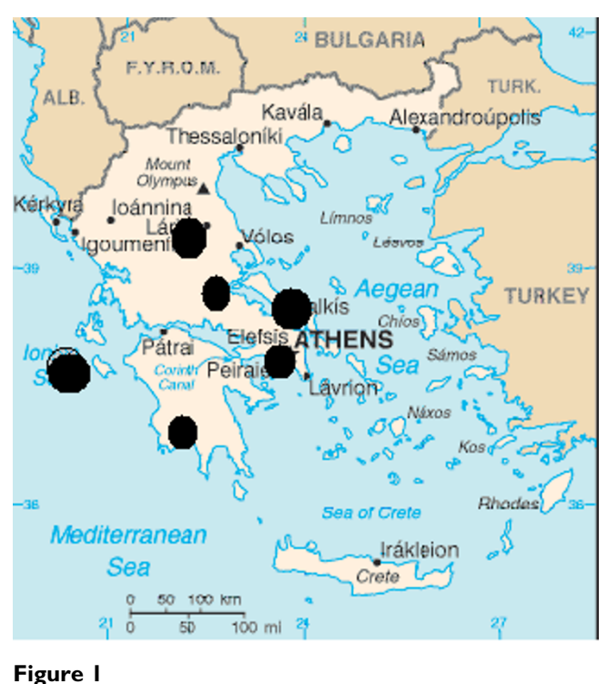
Regions covered by the study.

Between October 1, 2003 and September 30, 2004 (12 months) we enrolled almost all consecutive patients (participation rate = 98%) that entered in the cardiology clinics or the emergency units of six major General Hospitals, in Greece (Hippokration hospital in Athens, and the general hospitals in Lamia, Karditsa, Halkida, Kalamata and Zakynthos island). By the exception of Athens – where there are several other hospitals -, all the other hospitals cover the whole population of the aforementioned regions, including urban and rural areas. The studied regions were randomly selected from all Greek regions in order to cover a wide range of the county (Figure 1).